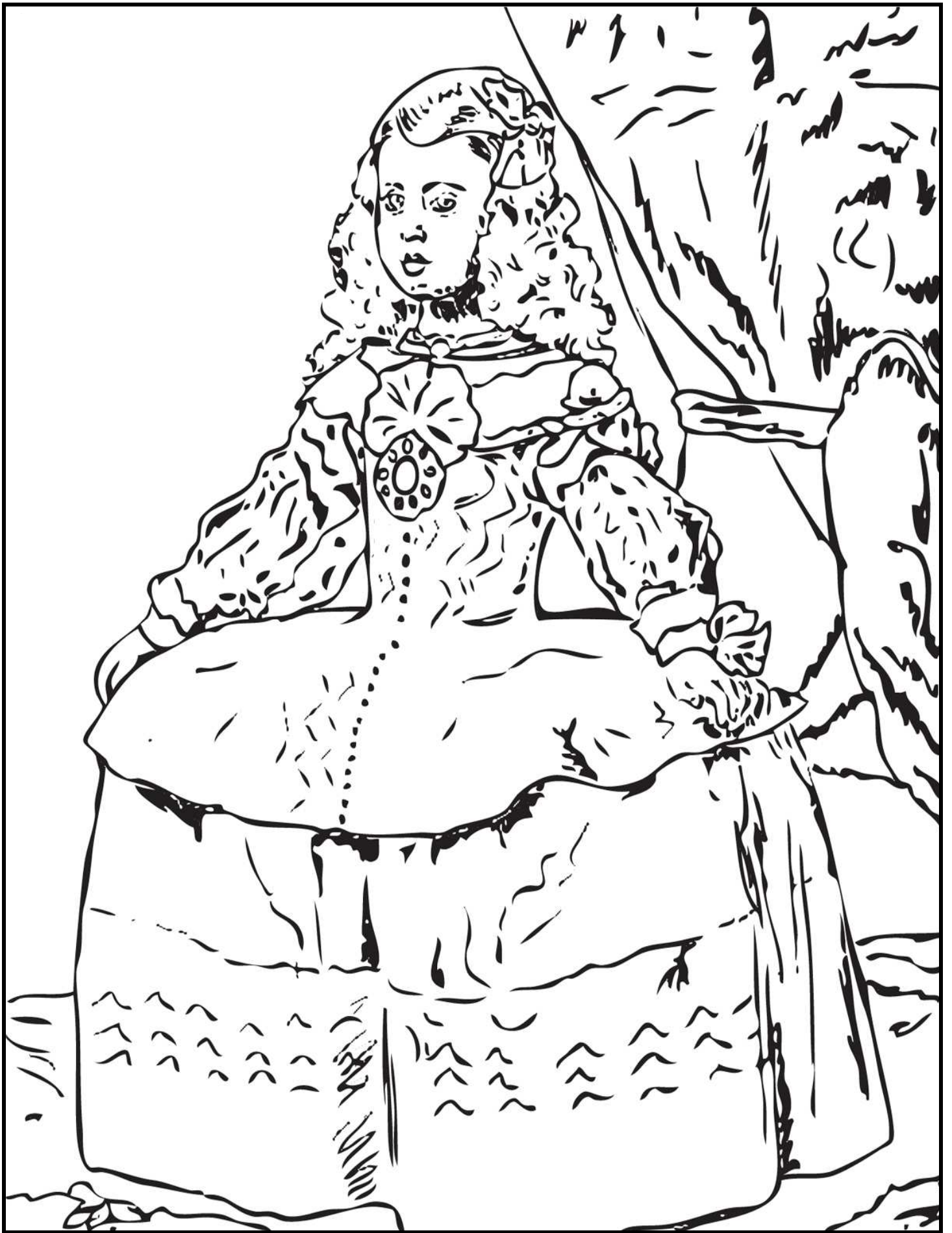
“RETRATO DE LA INFANTA MARGARITA DIEGO VELÁZQUEZ