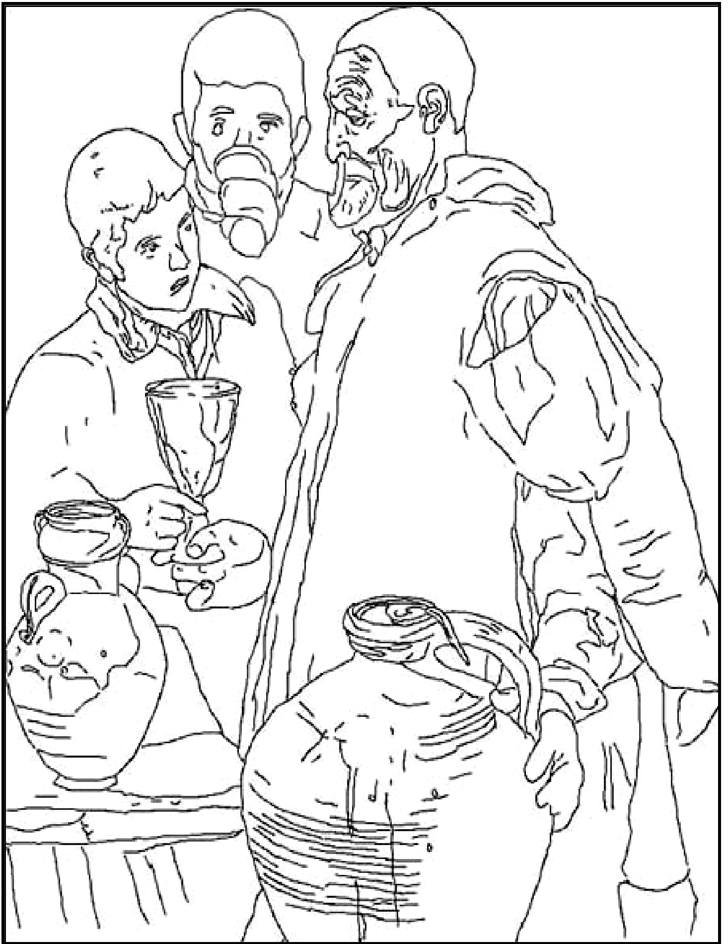
"EL VENDEDOR DE AGUA" DIEGO VELÁZQUEZ