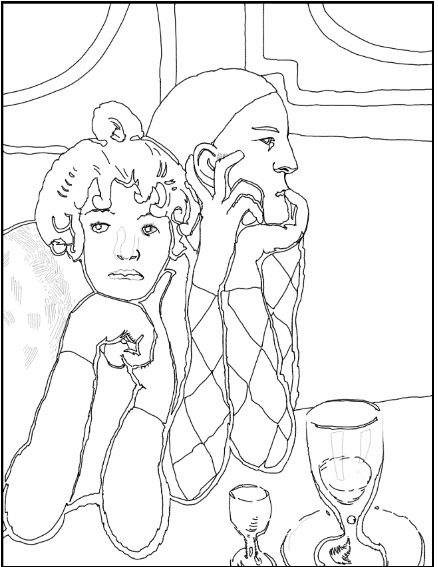
"LOS DOS SALTIMBANQUIS" PABLO PICASSO