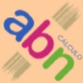
Tabla de m